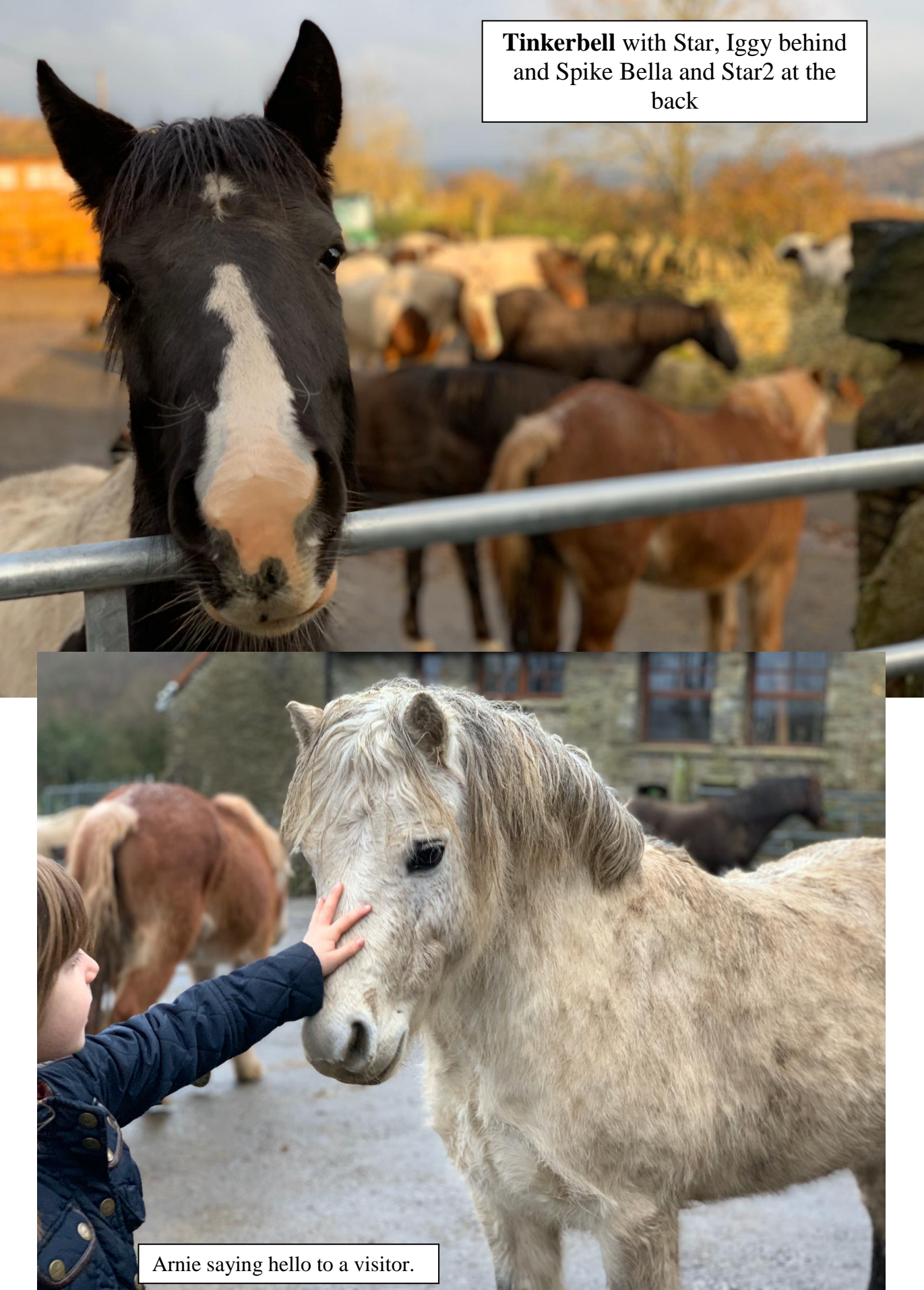
News, Views and thanks of how you help us help them. Page 7