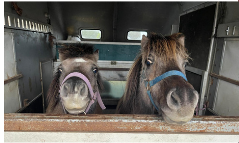
Gilly & Freida being collected

Gilly and Freida who are also Mother and Daughter, joined our herd, after many lovely years in a caring foster home. Due to an essential house move, we stepped in and collected them both in January, bringing them to the sanctuary of Hillside.