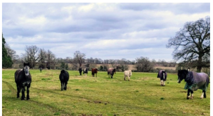
The Ponies from Keswick enjoying the fields

You have made this wonderful story possible and helped us protect them from going to slaughter– thank you.