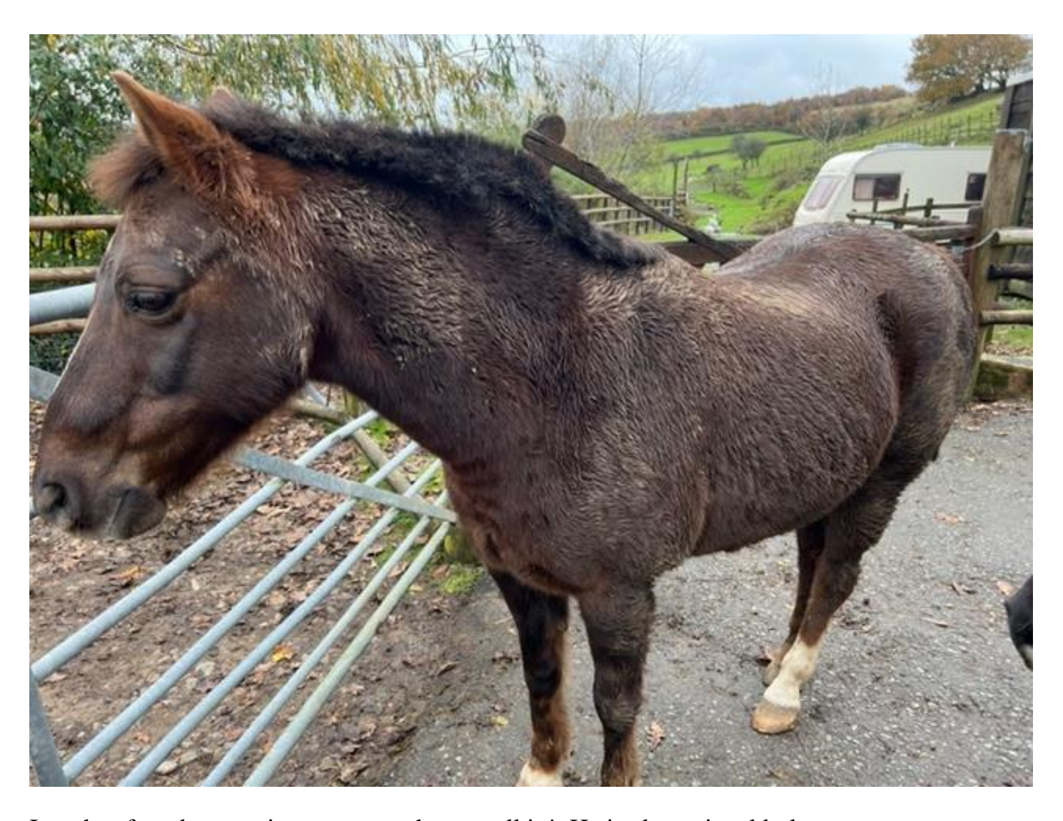
Iggy has found some nice soggy patches to roll in! He is also quite elderly now.