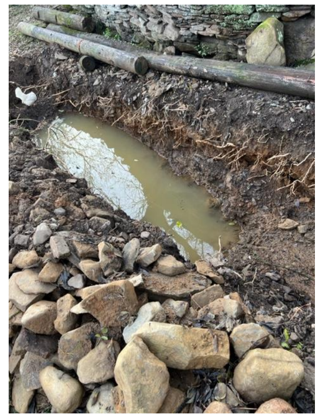
Bess has not yet got a stable for the winter. She is a big girl and possibly in foal. These are the footings going in for a good-sized stable to hold her foaling box. We have been having a