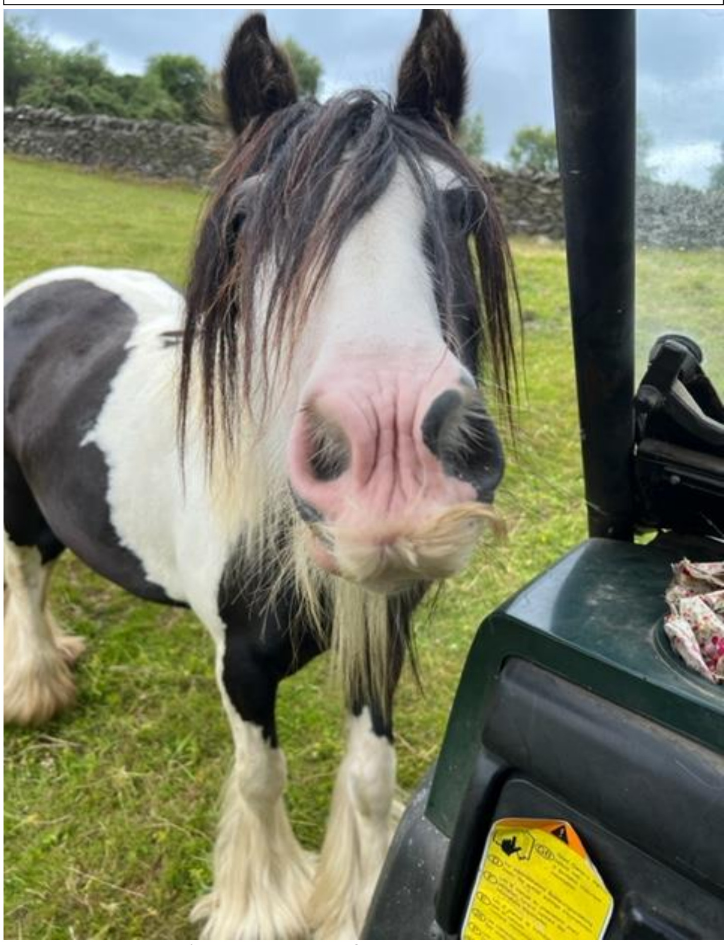
News, Views and thanks of how you help us help them. Page 5

Oreo looking windswept and wonderful! Much more relaxed and seems to have come to terms with her missing eye. She is very aggressive with the others over treats and tit bits though.