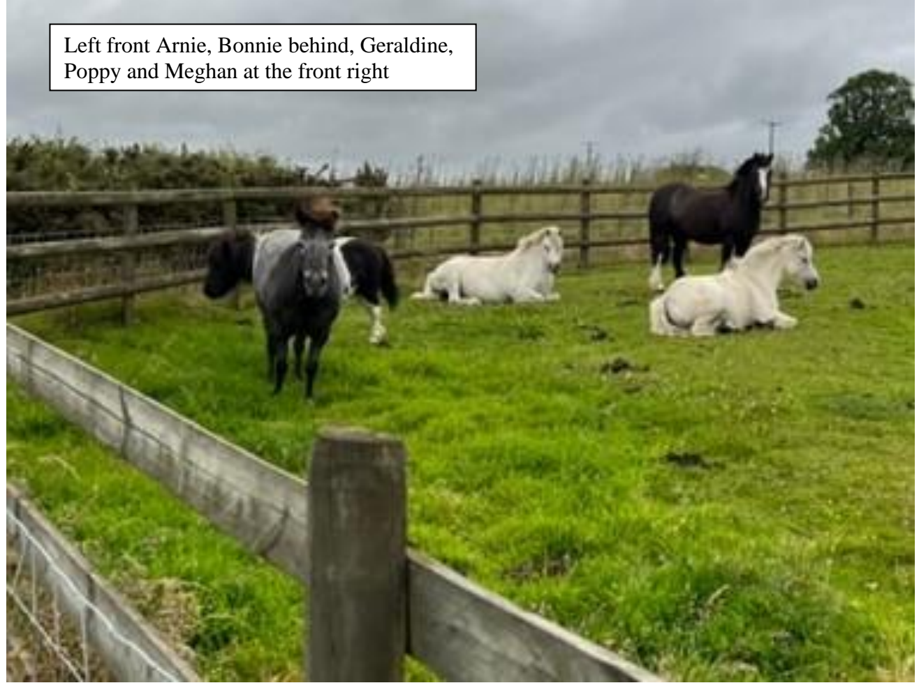
News, Views and thanks of how you help us help them.