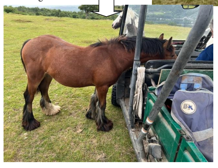
The ponies love the high pastures on the Farm