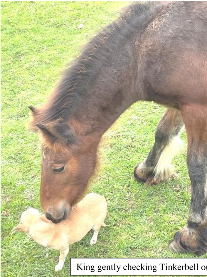
King gently checking Tinkerbell out