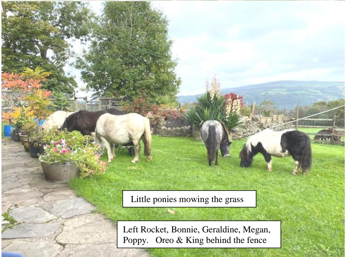
Little ponies mowing the grass