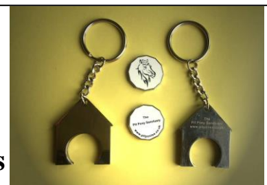
Angel 19?? – September 2021

News, views and thanks or how you help us